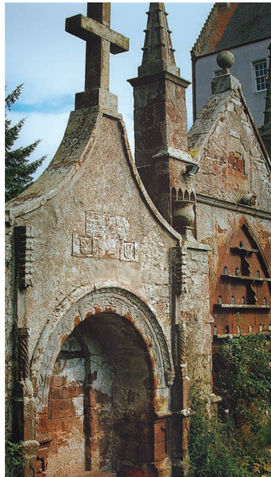
Scotland