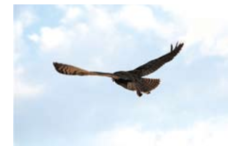
Great Horned Owl released by Liberty Wildlife

On the actual one-year anniversary of the accident, Sunday, July 27, 2008, family and friends gathered at Steele Indian School Park for the dedication of a beautiful memorial, created