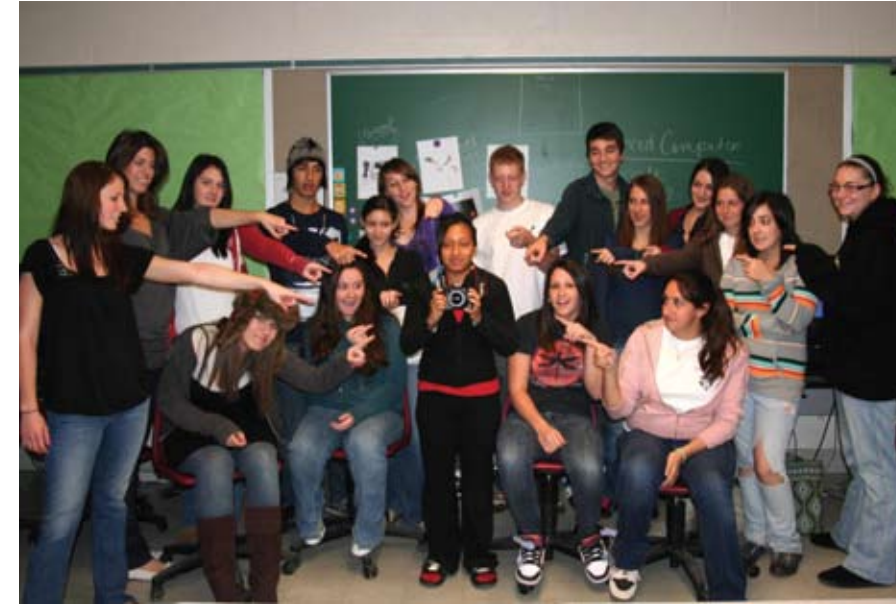
Huntington High School students show off one of their new cameras