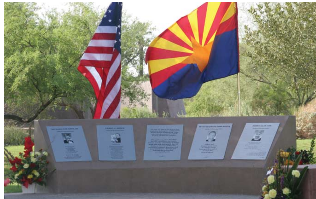
Steele Indian School Park Memorial